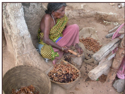
Lingayath old women cleaning fruits of Tamaindus indica collected from the forest

While wild edible plants do not bridge the existing gaps in nutrition, without them, this gap would be much wider.