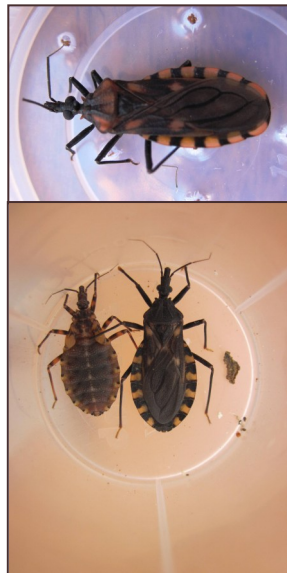
Specimens of triatomine collected in the surroundings of domiciles in Bahia. A. Triatoma pseudomaculata . B. Nymph (top) and female (bottom) of Triatoma infestans

education in long-term health (Abad-Franch et al., 2011).