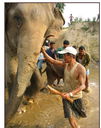
Shepherding Lakshmi Kali and newborn calf

Elephants and their kin, the mammoths, have been a successful taxonomic family, covering much of the earth, but their numbers declined as human populations increased, with co-existence in some areas, and extinction in others. We are the main driver pushing them towards extinction. We are wiping them out, generation by generation. Elephant numbers plummeted throughout the 20 th century, and although there are success stories, the trend is