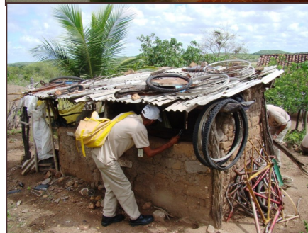
Collecting of triatomines inside the houses and surroundings