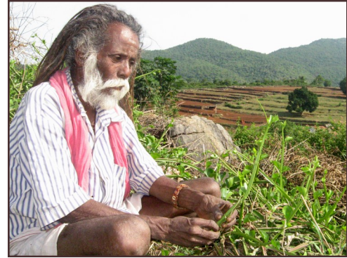
Soliga man collecting Cissus quadrangularis plant shoot for preparing food in Kombudukki village MM Hills

School education has replaced traditional apprenticeships, displacing knowledge about indigenous food plants.