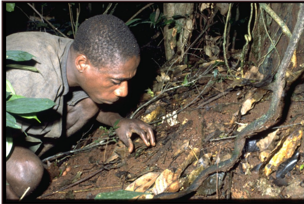
Baka Pygmy searching for chitin leftovers from bees fallen prey to ants, indicating the potential presence of an active beehive

All those with a passion for the world of bees can join together in a collaborative action that valorizes their knowledge and contributions to management practices that are more respectful of nature.