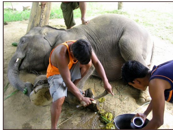
Cutting Narayani Kali's toenails

His previous work documenting traditional land use of First Nations in Canada has led him to an approach that will place some emphasis on the spatial and temporal dynamics of this knowledge, in an effort to add depth to other elephant studies in