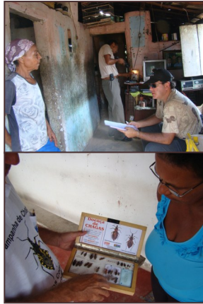
Conducting the ethnobiological survey