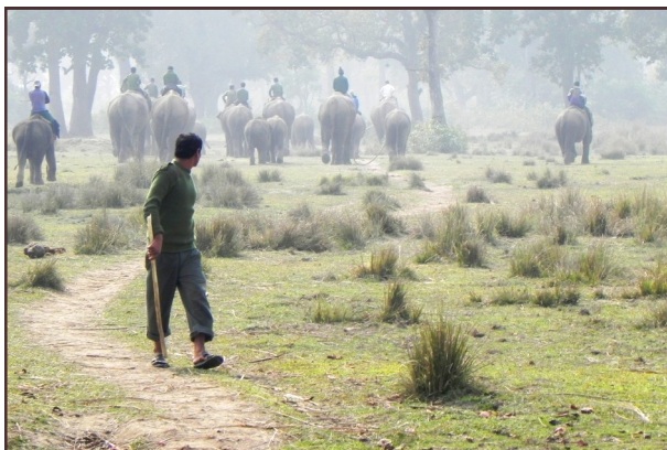
Elephant teams going off to graze

Currently, the documentation of Indigenous knowledge about elephants is inadequate, despite Indigenous peoples being highlighted as making the some of the best mahouts