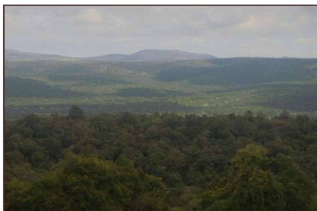
The Loita landscape

Only by respecting and nurturing their relationship with the diversity found in nature can Loita Maasai communities promote harmony and good health to both humans and their natural environment.