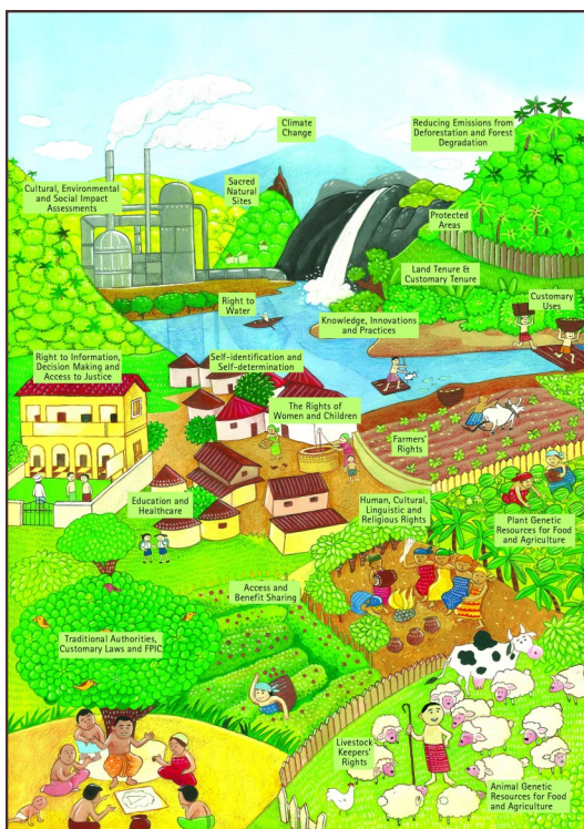
This illustration of the legal landscape helps people to see how laws and institutional frameworks operate at the local level.

The Living Convention on Biocultural Diversity is available for download.