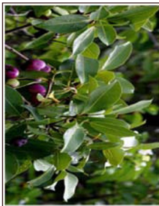
The fruit and leaves of Syzygium guineense (Willd.) DC. are used in many parts of Ethiopia

1 Department of Plant Production, Ghent University, Belgium