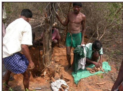
A group of people belongs to Lingayath community harvesting tuber ( Dioscorea pentaphylla ) in the forest