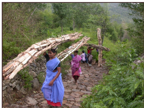
Women carrying fire wood to sell in the market

perennial shrubs and climber species, despite issues regarding water availability.